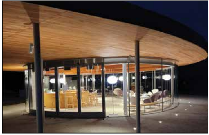
ful Pavilion area, all glass, you will enjoy a wonderful tea experience!

It is free to visit and explore the beautiful grounds at Grace Farms. It is serene, calming, and beautiful. Take a walk, visit for an event in their beautiful auditorium, or go for afternoon tea. You will not be disappointed! "The River building was intentionally designed to help visitors pause and consider what it means to flourish personally and as a community." And inside the beauti-